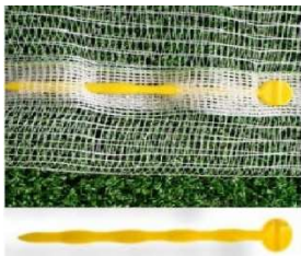
Nail to close the nets