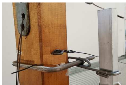
KIT "EVO H"