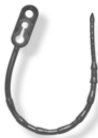
Fascetta LEGO in 19cm

To maintain the net tensioned in the bottom, you can use a spring spreader to be applied on the posts (in wood, concrete or metal) one each 7-8m, these can be mounted under the net to tighten the net or to enlarge the net.