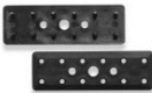
Clip to join the nets