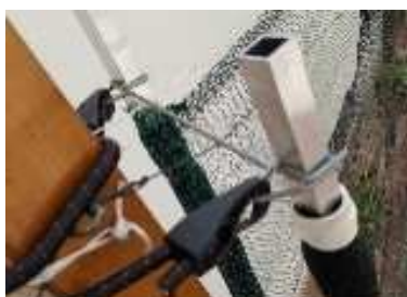
KIT "EVO G"